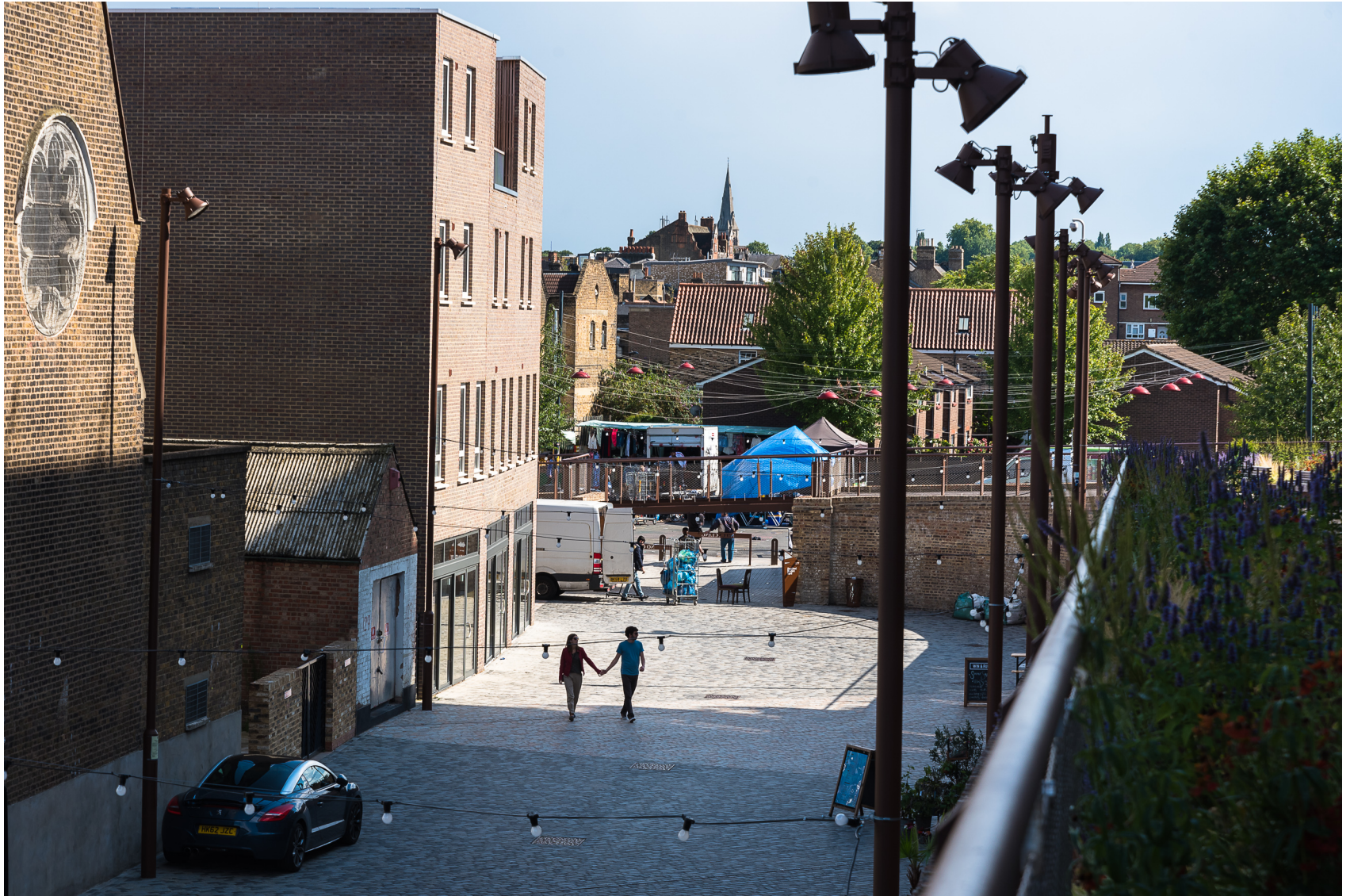
The New Deptford and Its People