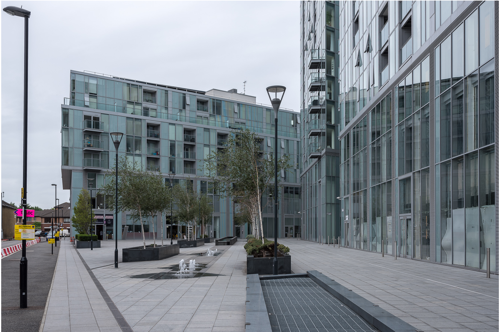
Gentrified Yet Sparse Deptford