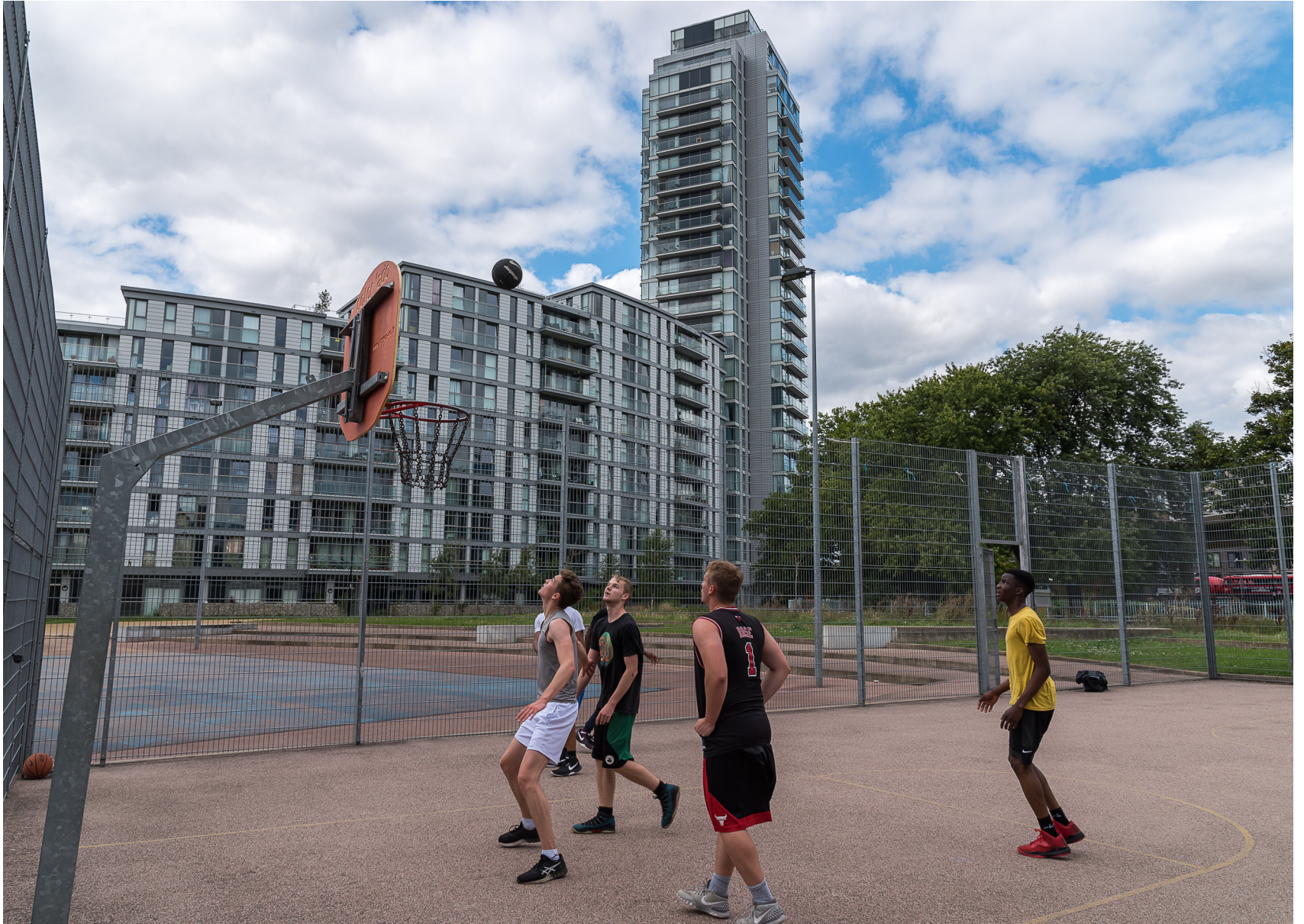
Recreation in Gentrified Deptford