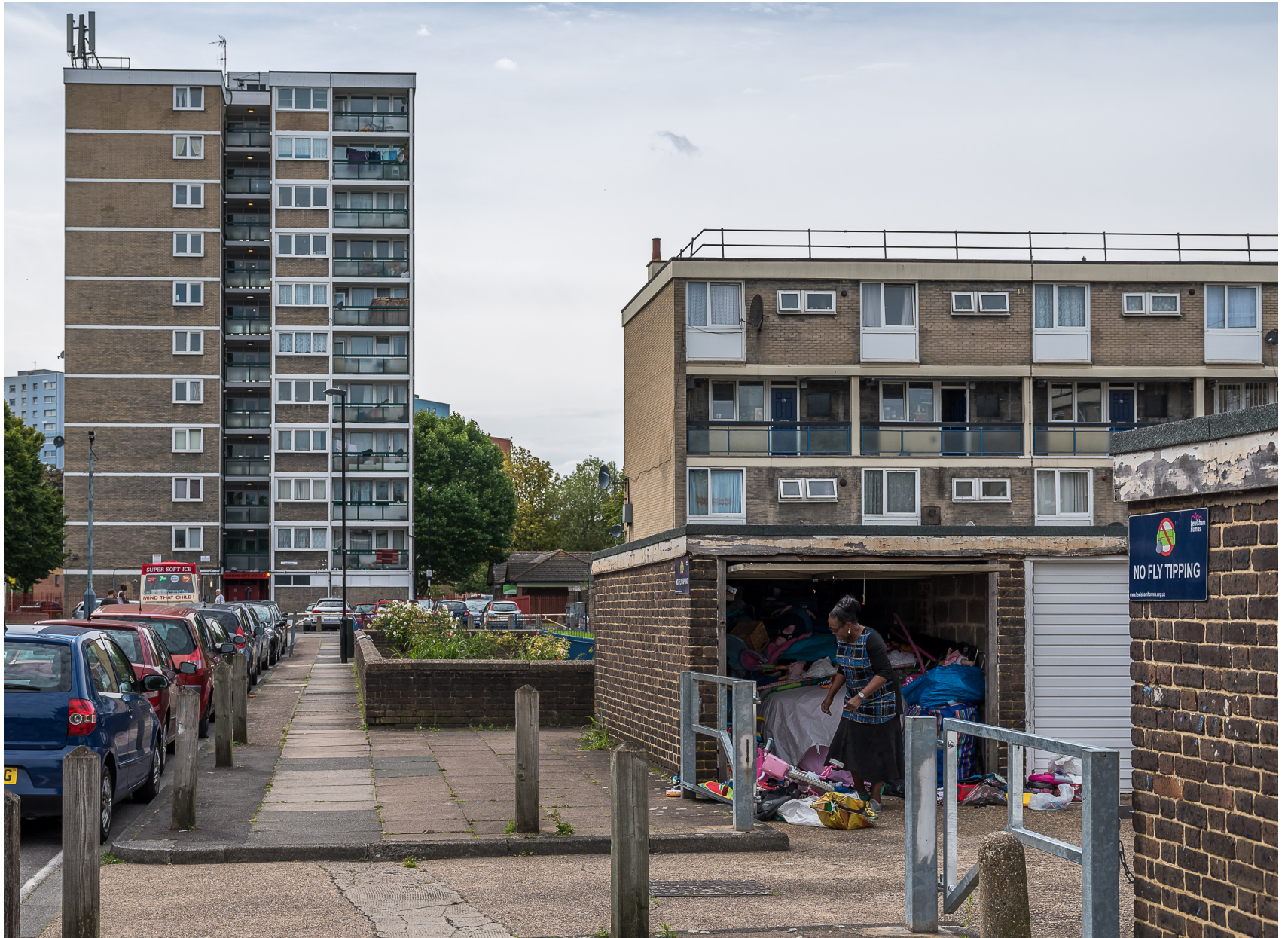
The Poorer Side of Deptford