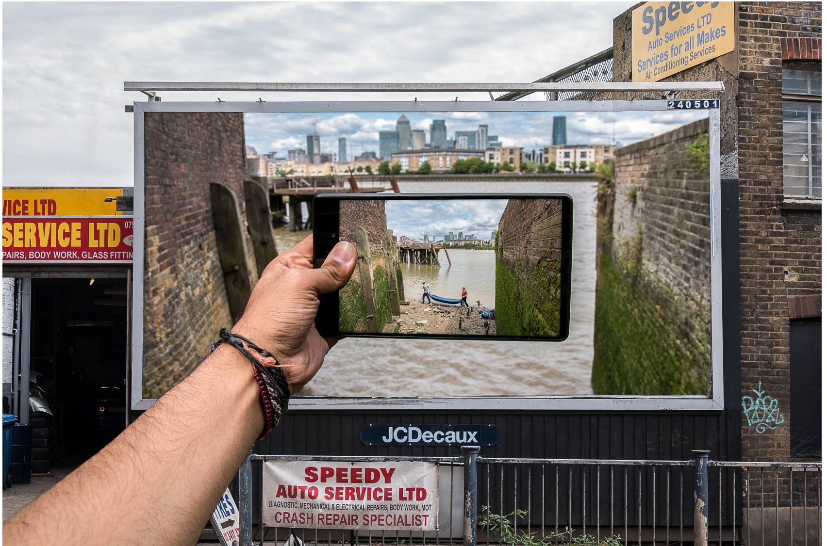
Advertising New Deptford