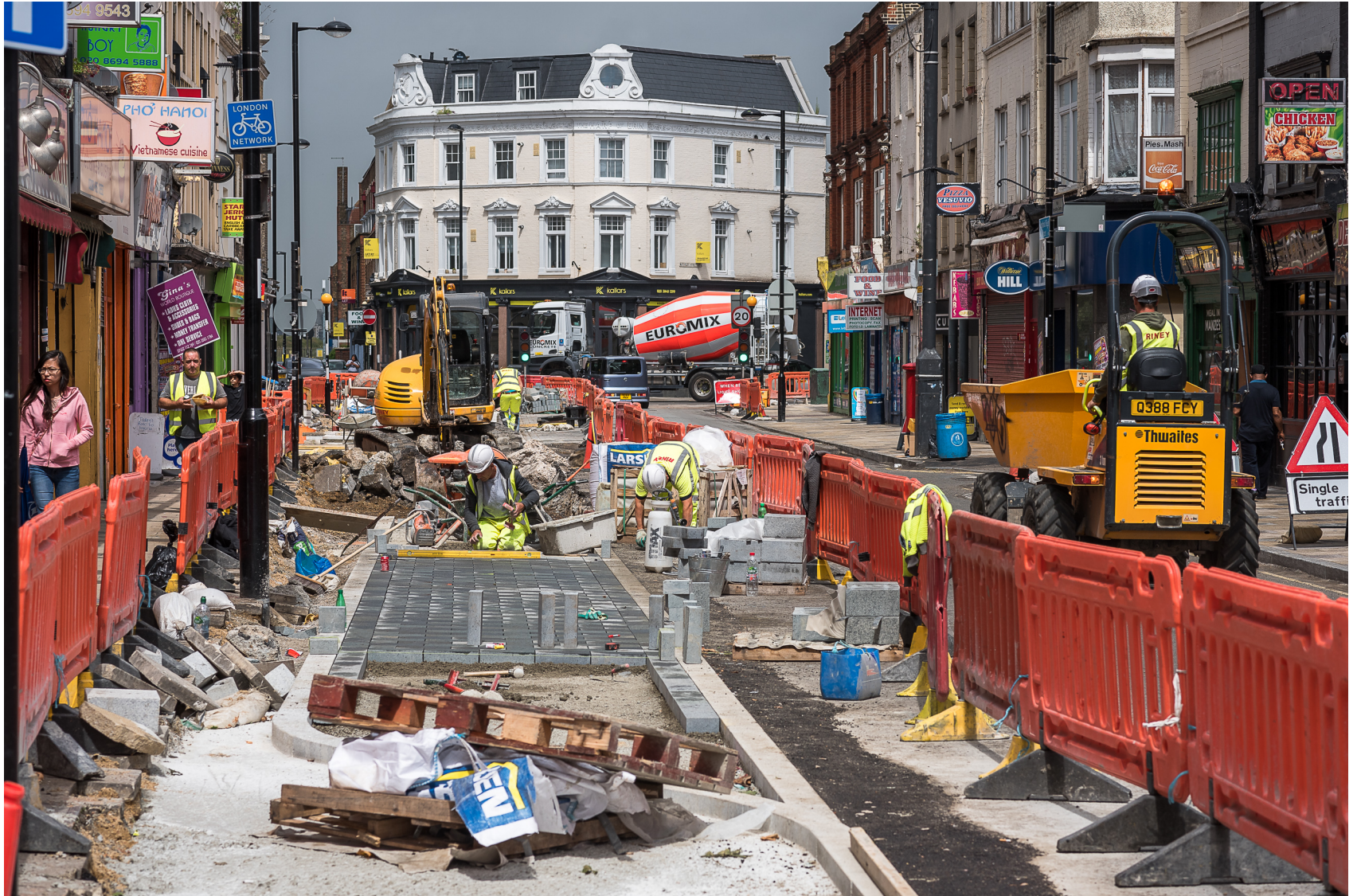
Yet Still the Developments Come, Even on the High Street