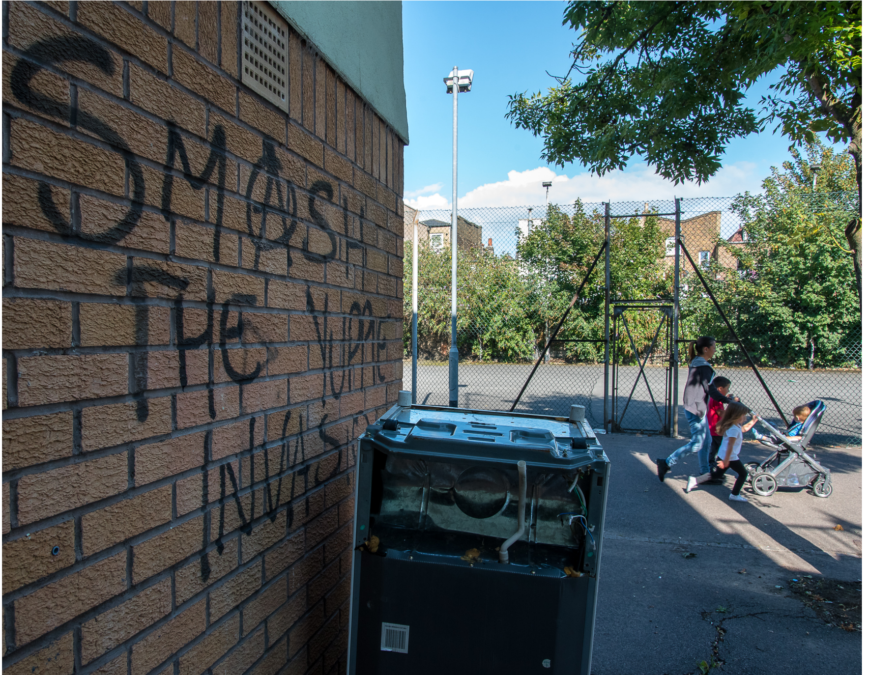
Opposition to the Developments