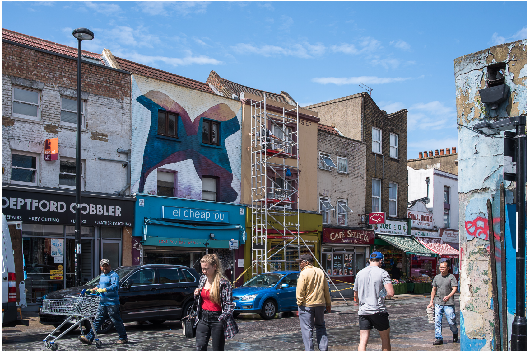
Deptford High Street, With Gentrification in Progress