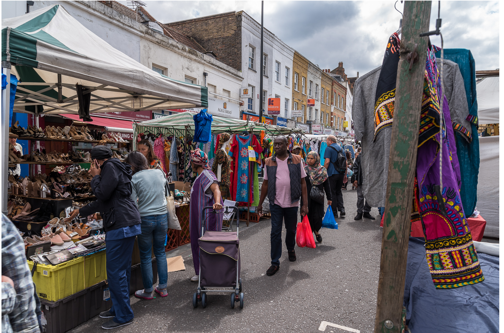
A Vibrant Scene