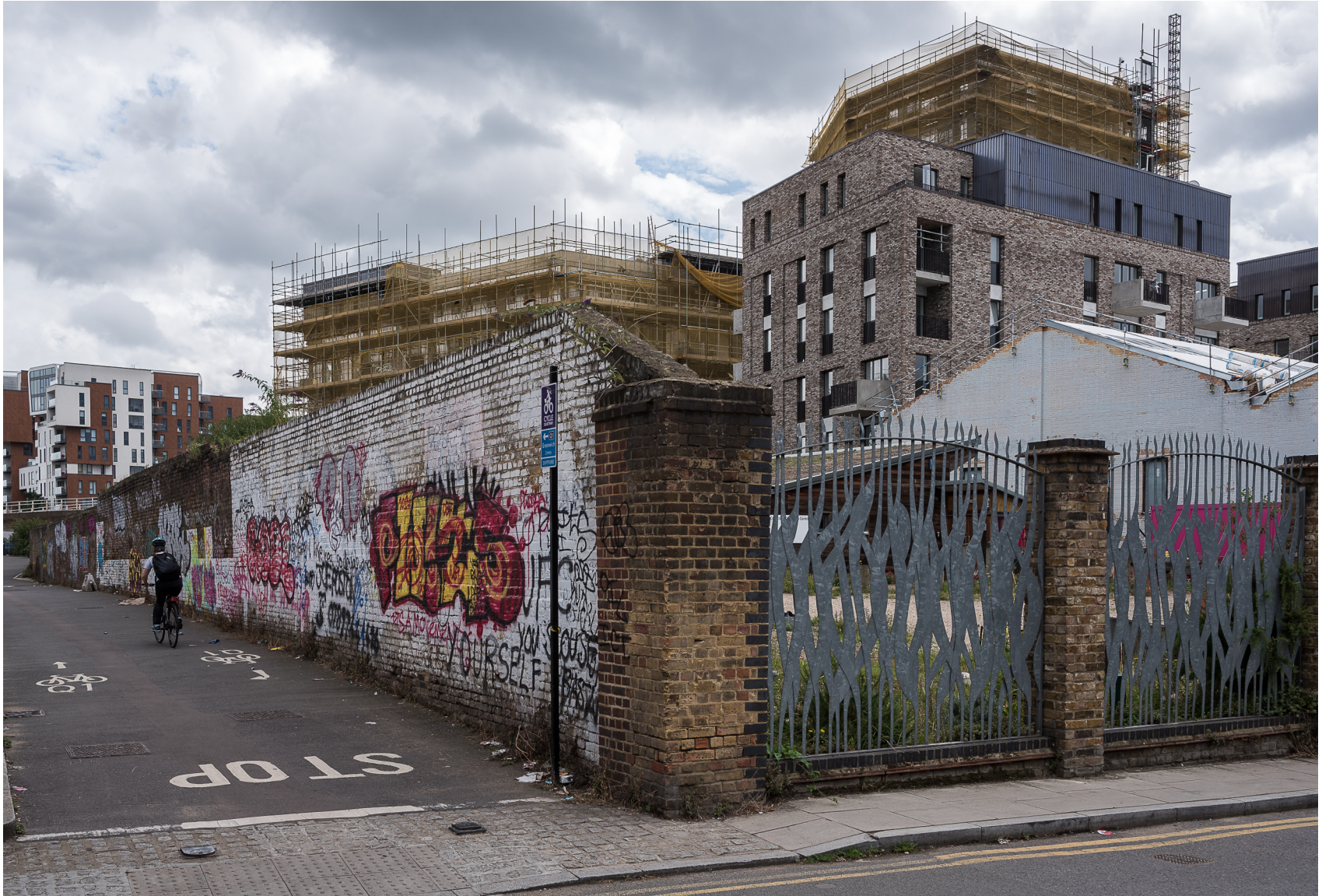
Some Developments Rising Above the Poverty